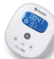
MYA JOY BREAST PUMP