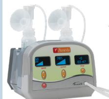
AMEDA ELITE™ BREAST PUMP