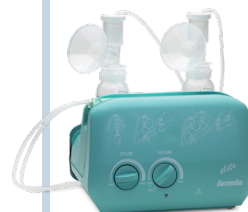
AMEDA PLATINUM™ BREAST PUMP