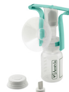
ONE-HAND MANUAL BREAST PUMP

This is general information and does not replace the advice your healthcare provider. If you have a problem you cannot solve quickly, seek help right away. Every baby is different. If in doubt, contact your physician or other healthcare provider.